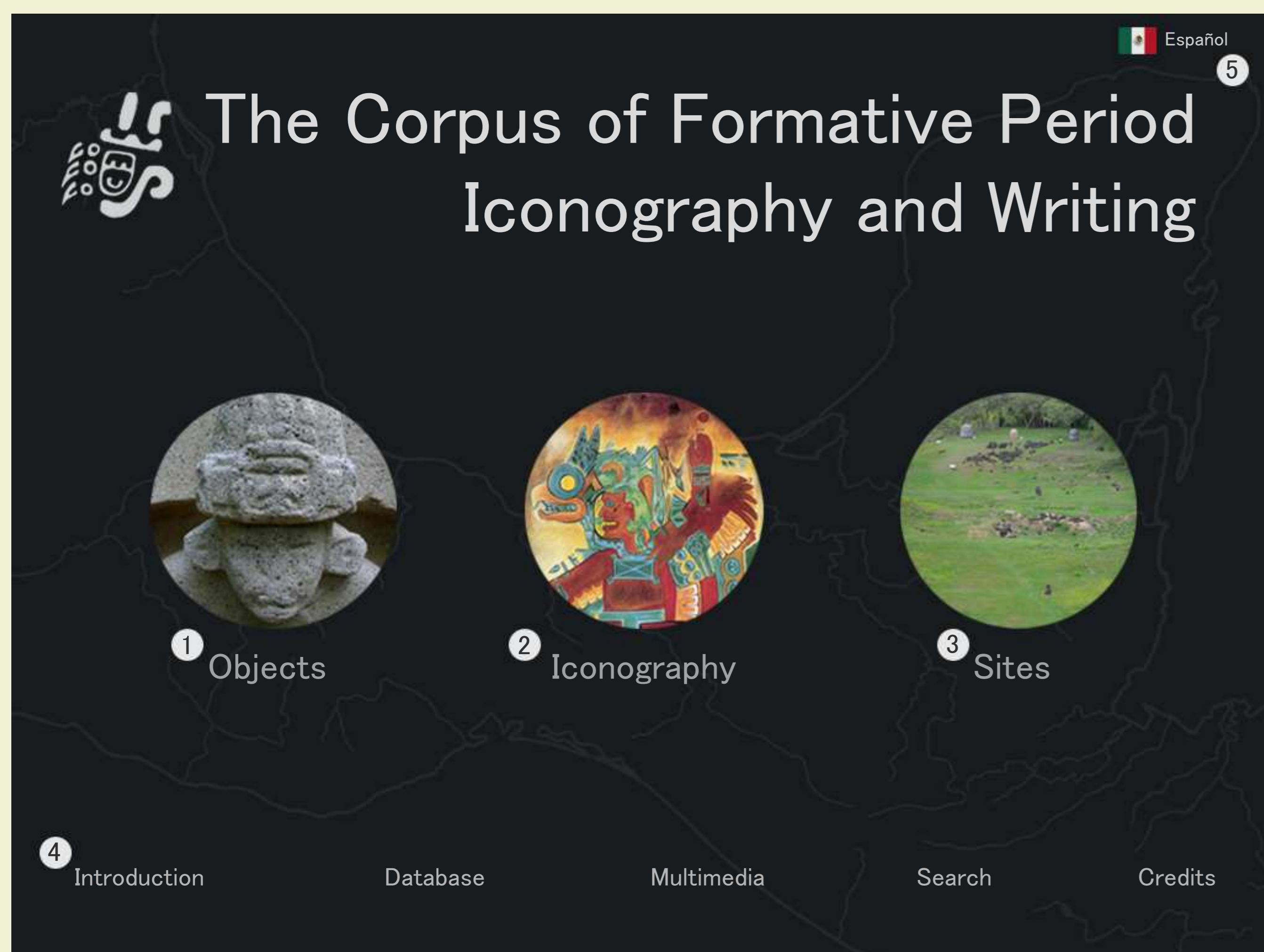
(a) Main Screen

Web and mobile applications are under development to make the corpus and associated research tools available to researchers in the lab or in the field. From the home screen (Fig. 1a), users will have three primary points of entry: Objects, Iconography and Writing, and Sites. Selecting Objects will call up a list of specific objects in the catalog with thumbnail photos of each object. Selecting one of the photos will take the user to the Object View screen (Fig. 1b) which displays a high-resolution image of the object, information about the object, and additional options. Selecting Iconography and Writing (Fig. 1c) calls up a list of iconographic motifs and script elements found on objects in the database. Selecting an individual motif, users may either access a list of objects on which the motif appears or bring up a map view that displays all sites at which the selected motif has been found. Selecting Sites (Fig. 1d) calls up a scalable, interactive map that displays all sites at which objects in the database have been found.